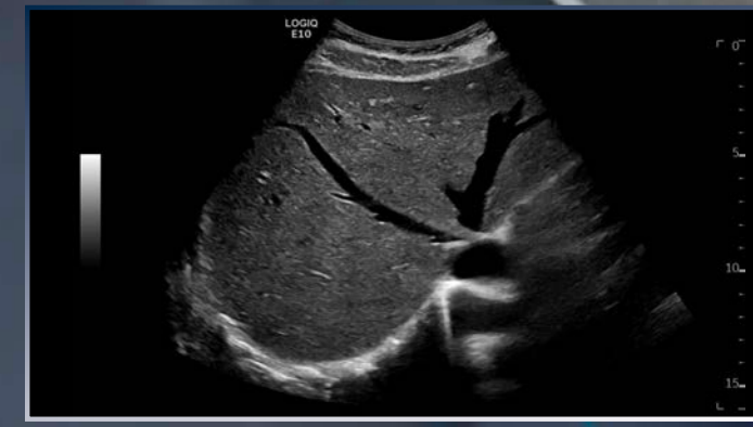
Trans Liver Hepatic Veins Normal, C1-6-D