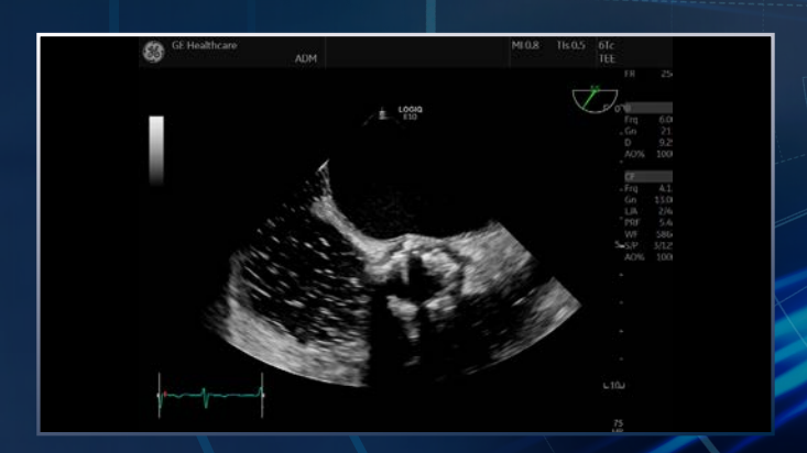
Transesphogeal Echocardiogray Bubbles Valve Replacement, 6Tc-RS