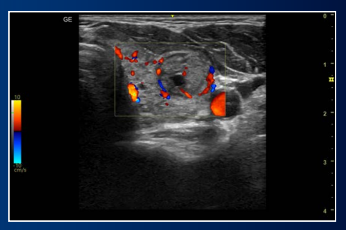
Sensitive color Doppler to examine thyroid vasculature and blood flow in vessels.