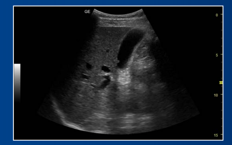
CrossXBeam<sup>™</sup> and SRI-HD to define structure borders clearly.