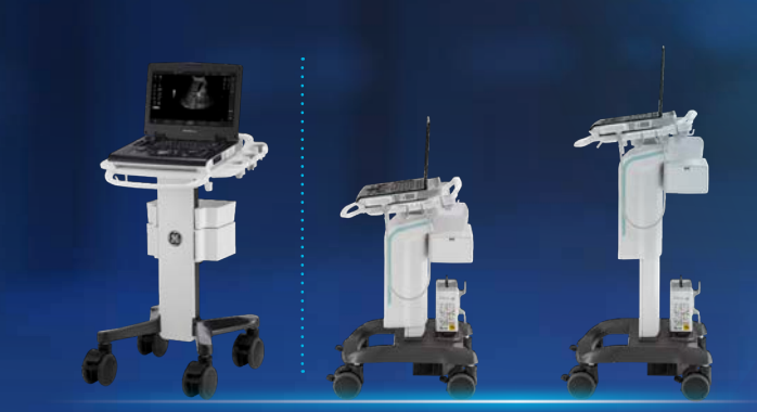
Choice of three optional carts with height adjustability option to suit scanning preferences

<sup>†</sup>Available on Versana Active v1.5