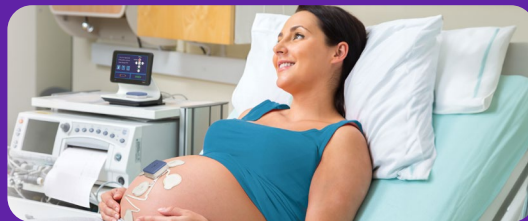
Corometrics™ 250x and Corometrics 170