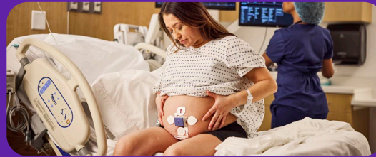
Novii+™ Wireless Patch System