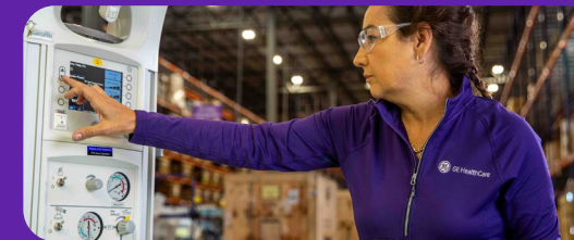
Critical care equipment services